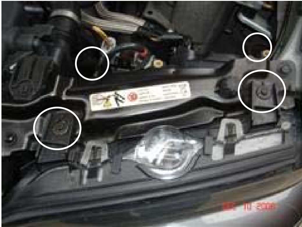
Complete headlight assembly.

Remove the headlights from the car. There are (4) 8mm screws. Disconnect all electrical plugs. Pull headlight out the front of car.